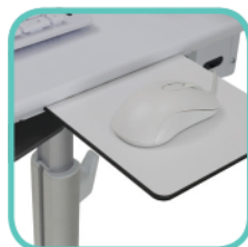
PULL-OUT MOUSE SHELF EXTENDS LEFT OR RIGHT SIDE; SLIDES UNDER THE WORKSURFACE WHEN NOT IN USE