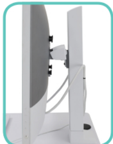
MONITOR RISER ATTACHES AT THE BACK OF THE WORKSURFACE