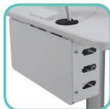
ENCLOSED CUBBY BENEATH THE WORKSURFACE FOR STORAGE OF POWER ADAPTERS, CABLES AND EVEN AN ULTRA-SMALL FORM FACTOR COMPUTER