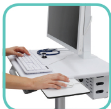
SPACIOUS WORKSURFACE: 23" X 20" (58,4 X 50,8 CM)