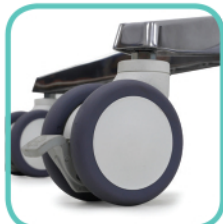
STURDY 4" CASTERS GLIDE EASILY ACROSS MANY FLOORING TYPES